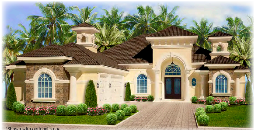
*Shown with optional stone.

*Photos may show features not included in base price. All dimensions and areas are approximate.